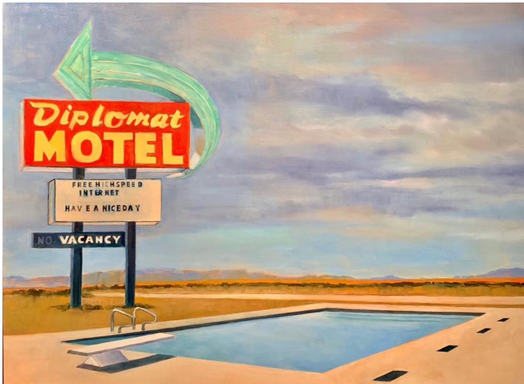
← Vacancy oil on canvas, 36" x 48"