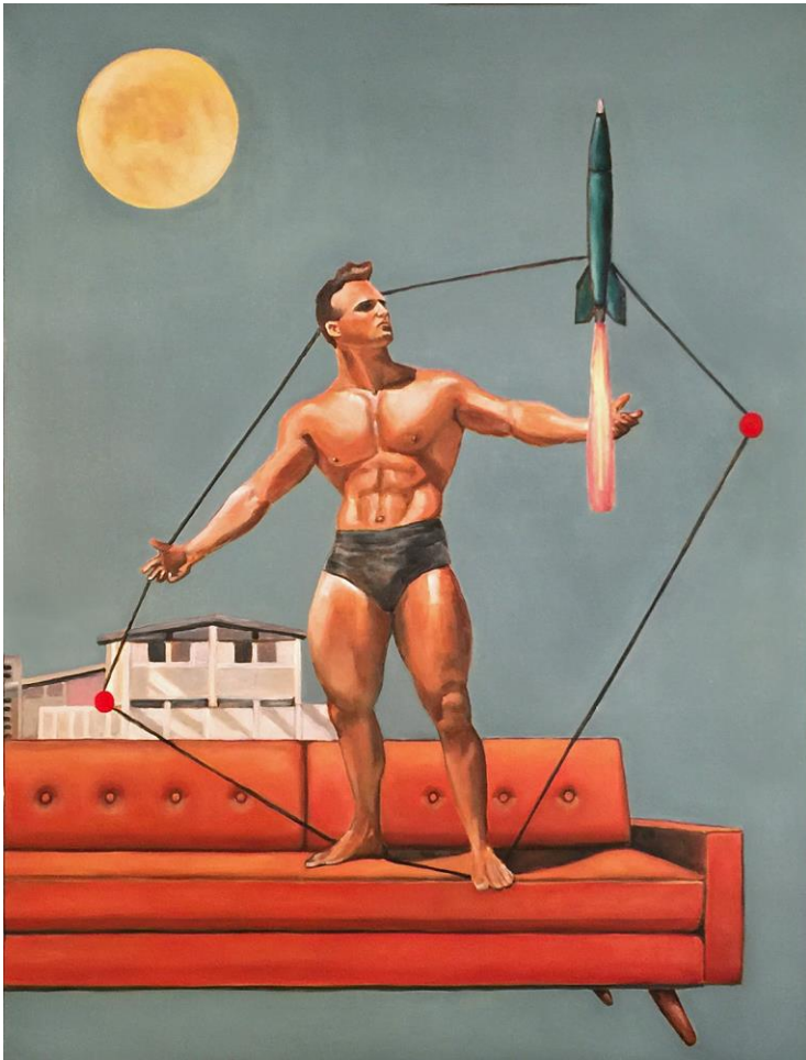
← To the Moon and Beyond oil on canvas, 40" x 30"

“Abstraction allows me a freedom of expression that I find liberating after the intense focus that working in a more realistic style requires.”