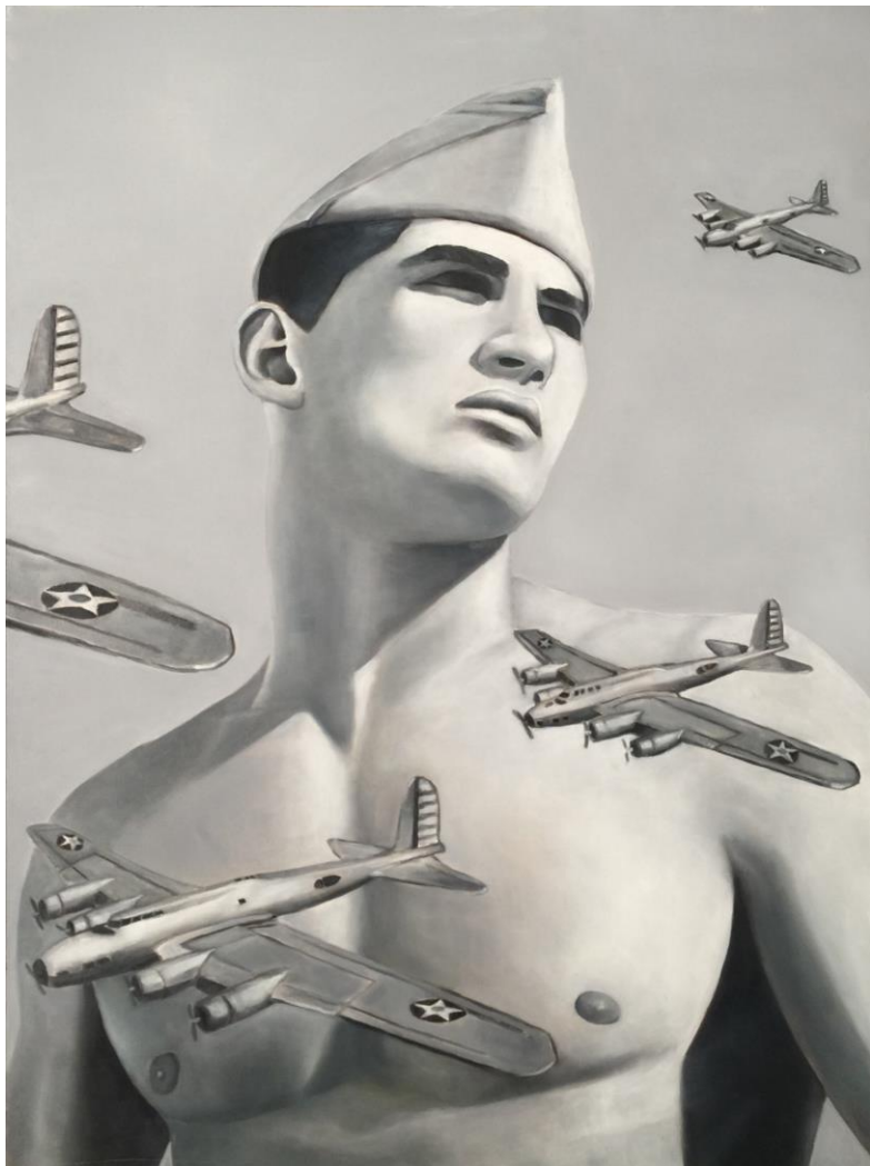
↑ War and Peace , oil on canvas, 48” x 36”