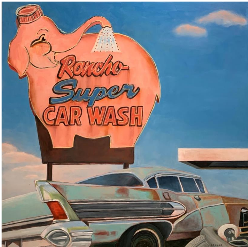
← Rancho Super Car Wash oil on canvas, 48” x 48”