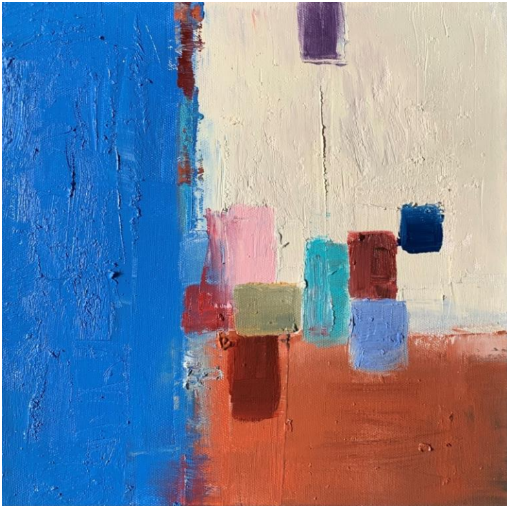
Carnival I, 12" x 12"