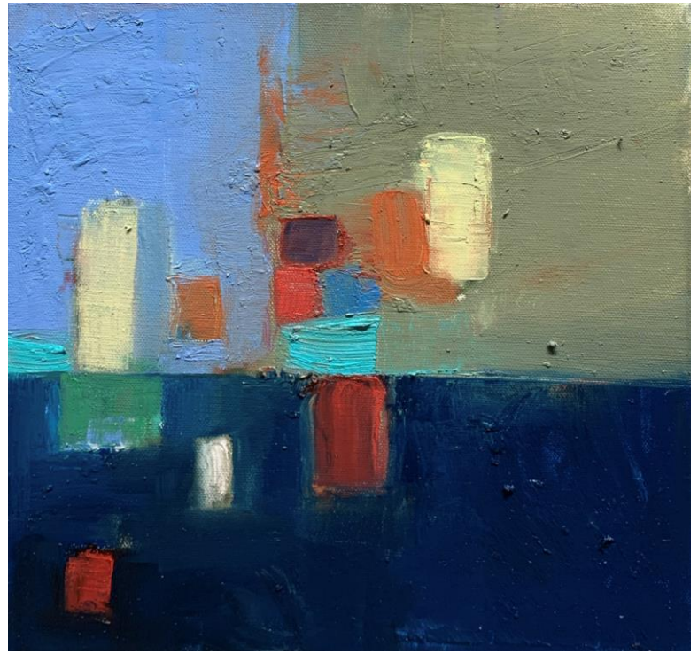
Carnival II, 12" x 12"