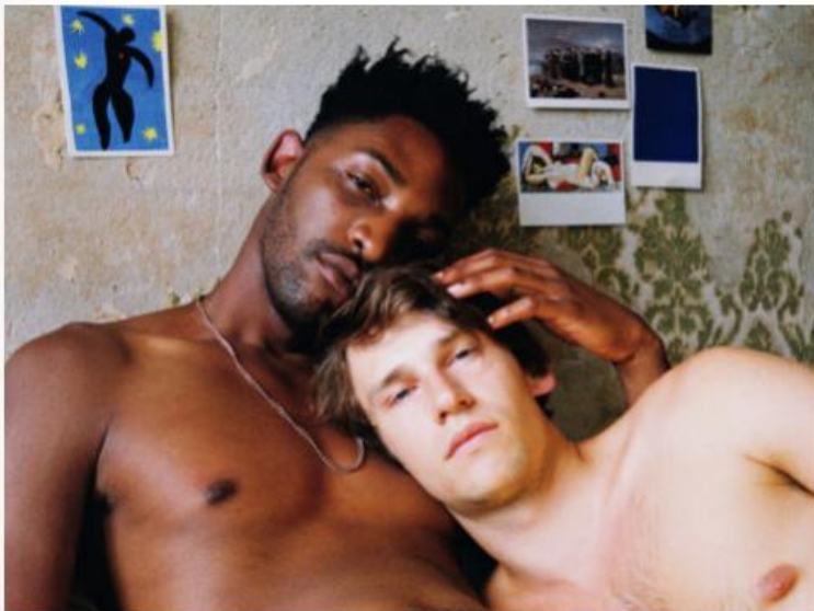
Summer Film Festival – Feature Film: BOY MEETS BOY

The films will be shown over three separate programs and a feature film, approximately two hours per program, with each program streaming for a one-week time frame.