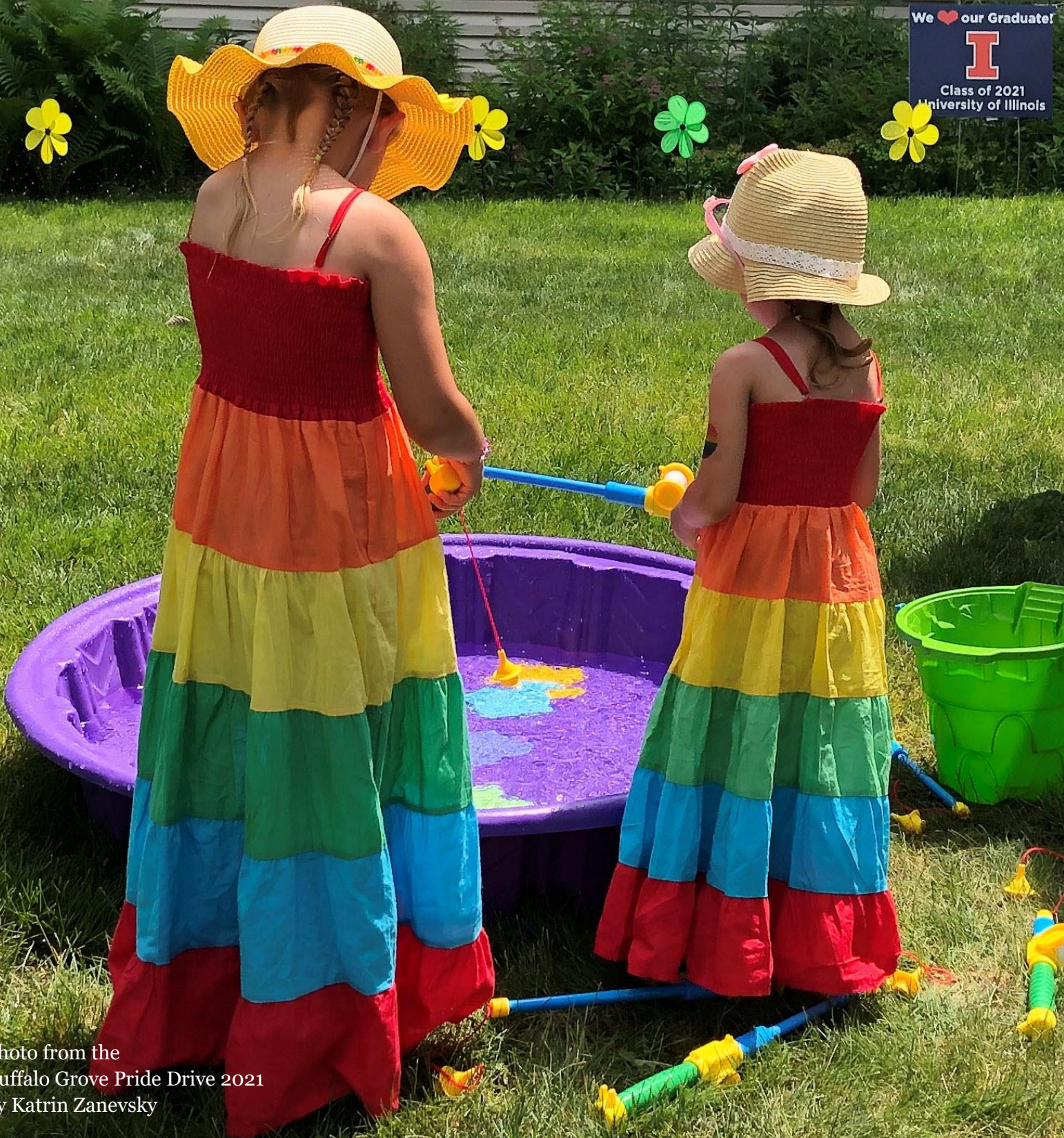
Photo from the Buffalo Grove Pride Drive 2021