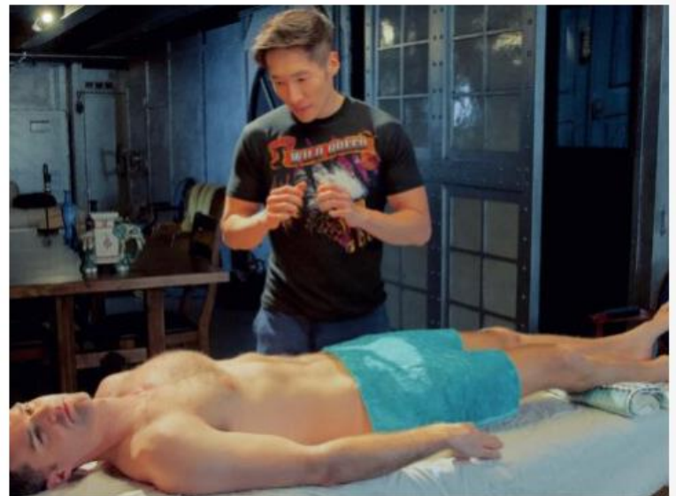
Summer Film Festival – Program C Streaming Online -August 1-7, 2021