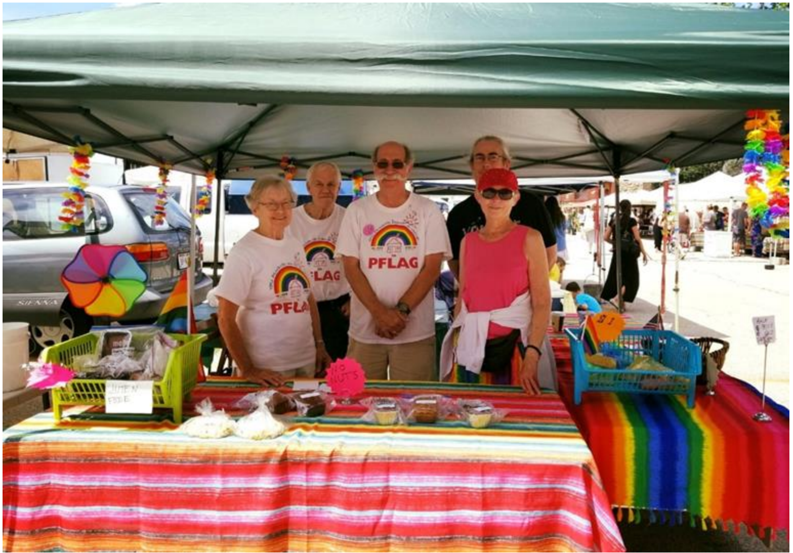
PFLAG Oak Park bake sale at the Farmers Market